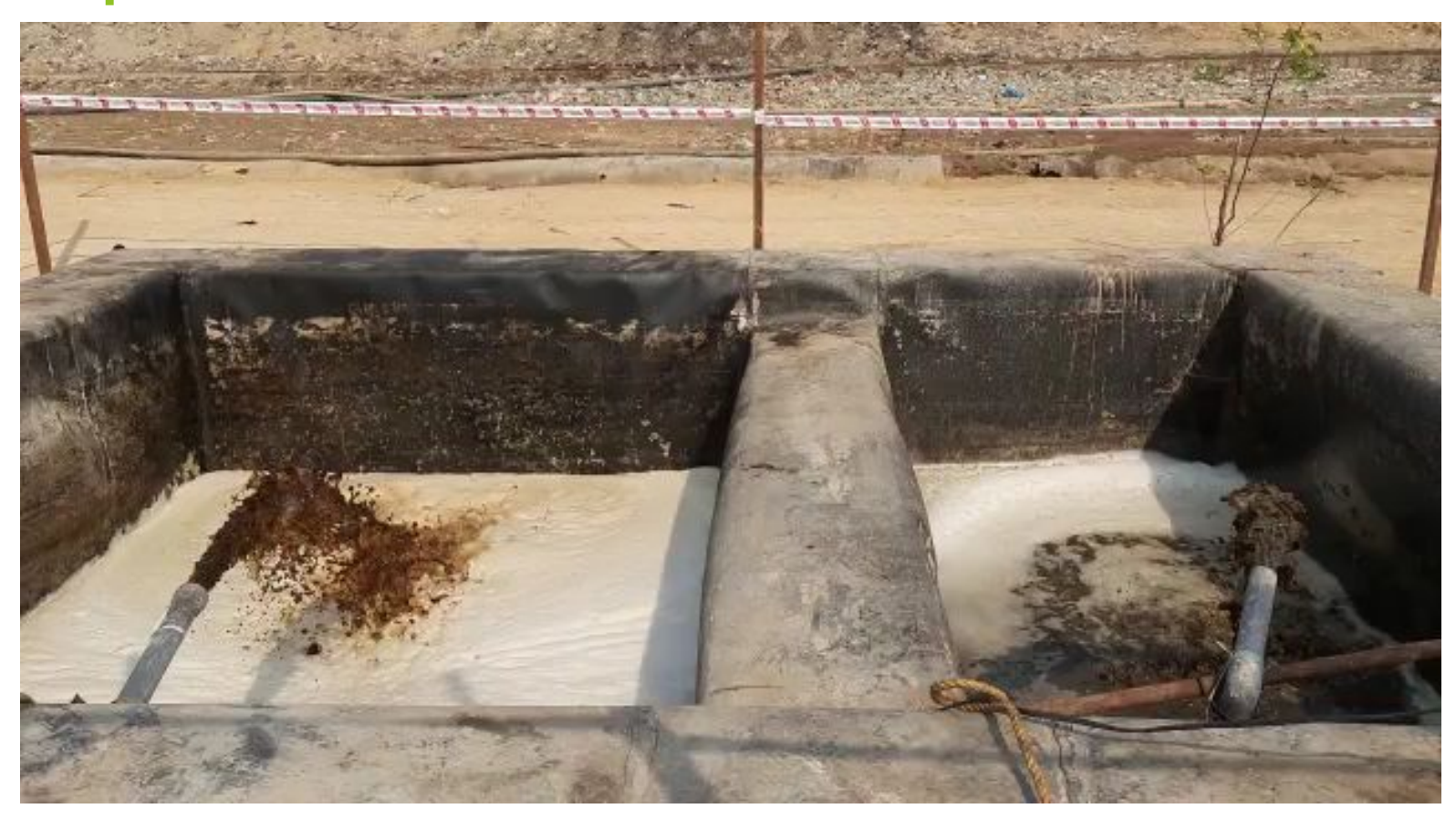
1st Sample Reports